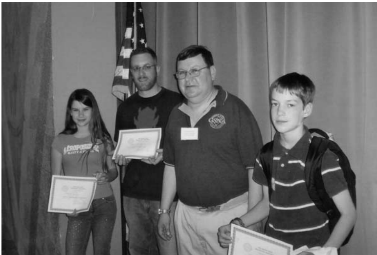
Exhibitors showing their certificates. Missing is Jim Majoros (photographer)