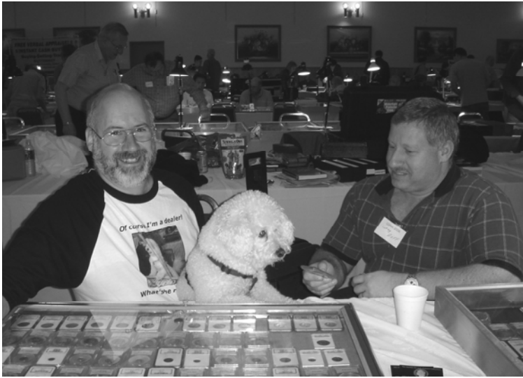
Dealers and customers of all races, religions, and species attended the show! (Look at the T-Shirt!!!)