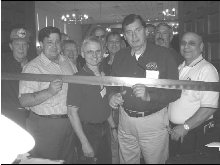
Cutting the ribbon to signify that the convention had begun!!